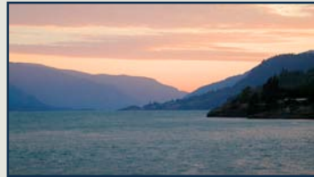
Preparing for Tomorrow